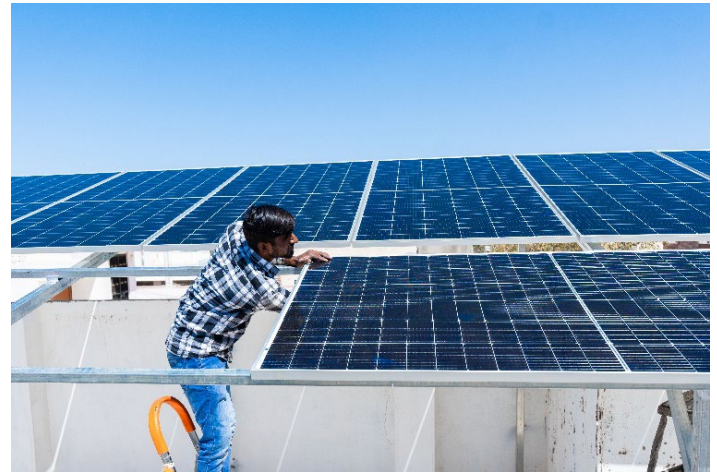
Indian worker installing solar panels on roof of house. Maintenance of photovoltaic panel system.

The program helped the development of the solar rooftop sector, helped to derisk the sector, made it more bankable and came to a completion in 2023. However, although the program was finished, the loan had another 13 years repayment period left, tying up IBRD's equity. The World Bank Group and the Government of India saw an opportunity to mobilize the private sector